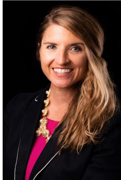
Sonja Ardoin Early Career Award