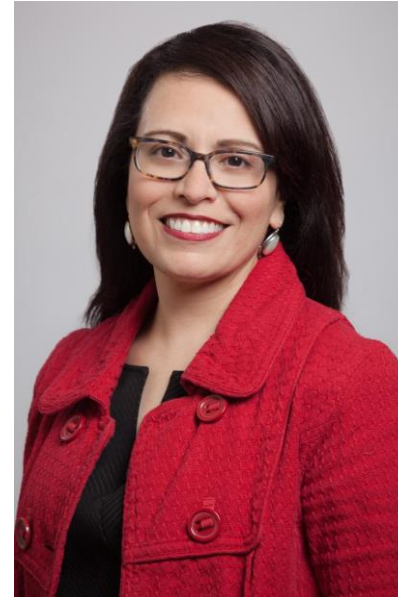
Michelle M. Espino Mid-Career Award