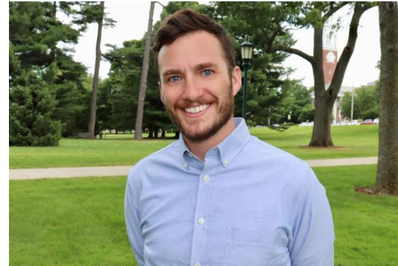
Jason C. Garvey Outstanding Publication