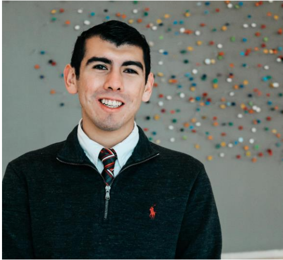
Antonio Duran Service Award