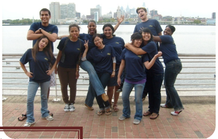
My Pride and Joy The Commuter and Transfer Assistants at Drexel