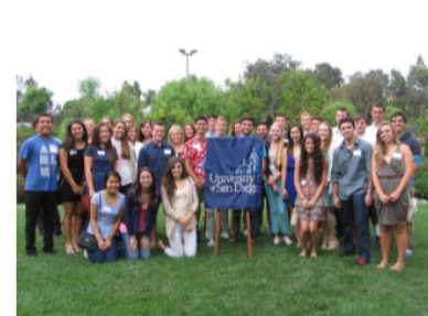
Summer Send Offs Program, University of San Diego