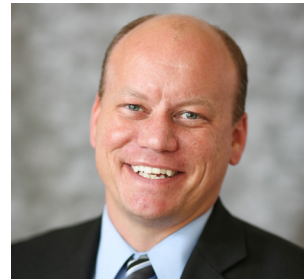
2022 Access Scholarship for the NASPA M. Ben Hogan Small Colleges and Universities Institute