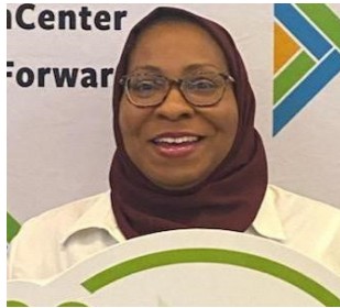
2022 Access Scholarship for the 2022 NASPA Conferences on Student Success in Higher Education

“ The NASPA Foundation scholarship has helped me to advance in my career. Attending the NASPA Student Success conferences gave me the opportunity to learn new strategies, skills, and best practices in advising and student affairs to effectively support my first-gen and low-income students. Attending the workshops and sessions, allowed me to self-reflect and focus on my professional growth. Not only did NASPA give me the opportunity to gain valuable knowledge to apply in my field, but attending this conference also gave me the confidence to further my career and pursue an advanced position in advising. I am now an associate director of advising at an Ivy league university. ”