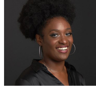
NASPA Membership Scholarship Recipient

Graduate Assistant, The Haven The College of William & Mary