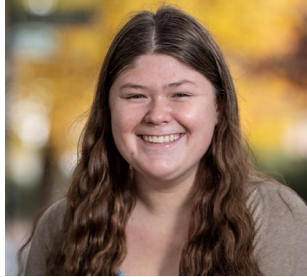
2022 Jim Rhatigan Fellowship Winner

“ It was truly an honor to have been recognized as a 2022 Jim Rhatigan Fellow. As a new professional to the field, it means a lot to me that there are people who believe in me and are interested in investing in my growth. Attending the NASPA Annual Conference was an impactful experience as I am continuously in pursuit of additional learning and growth. I believe that lifelong learning is so essential and allows me to gain critical skills to become the best practitioner possible. I am passionate about working to make positive change within the Fraternity & Sorority community, so experiences like this allowed me to connect with others and advance my skills and knowledge. I am grateful for opportunities like this and excited to continue using my time and talents to advance our field! ”