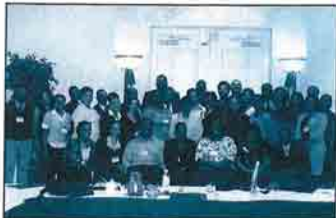
The African American Knowledge Community had a great turnout for the NASPA Convention in Tampa!

The AAKC Membership Assessment is still available on line. It can be accessed at http://www.naspa.org/communities/kc/community.cfm?kcid=15 . This instrument will help us gather further information on the needs and interests of African Americans in our profession. In the future, we hope this survey will lead to an even more in-depth study of this area with support from the NASPA Foundation. If you haven't done so already, please help us by completing this short survey.