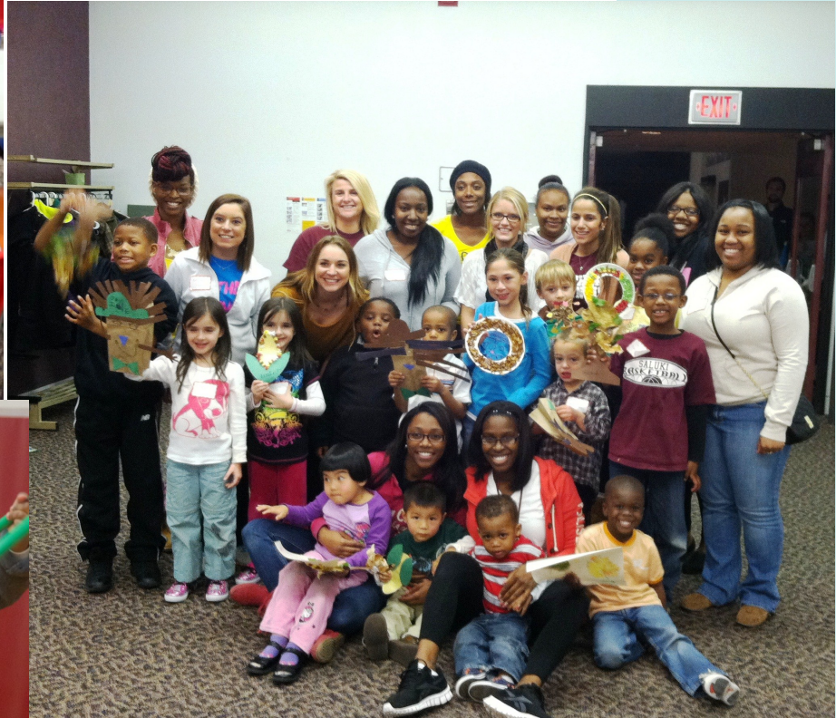
Photos from Southern Illinois University Carbondale's Family Fun Event

NASPA | KNOWLEDGE COMMUNITY ADULT LEARNERS AND STUDENTS WITH CHILDREN