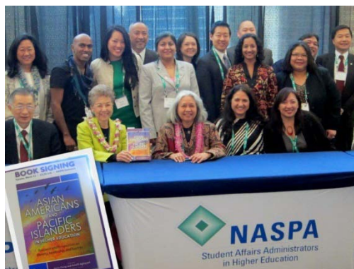
Authors of Asian Americans and Pacific Islanders in Higher Education gather for a book signing event at the 2012 NASPA Annual Conference.