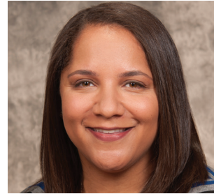
2018 Zenobia Hikes Scholarship Winner