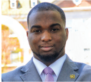
2018 Jim Rhatigan Fellowship Winner

“Attending the 2018 NASPA Annual Conference would not have happened if the NASPA Foundation did not select me as a Jim Rhatigan Fellowship recipient. Receiving these funds alleviated a huge financial burden off of me and I was able to enjoy my entire time without constant stress regarding cost. The NASPA Annual Conference is an environment that ensures future leaders in student affairs are achieving the proper preparation and networking with like-minded and successful professionals. Thank you to the NASPA Foundation and their donors for ensuring my success as a student affairs professional.”